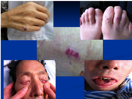
Figure 2. Skin (hands, feet, and chest) and mucosal (conjunctiva and tongue) nodules with eosinophil infiltration.

CSS can virtually affect any organ, such as the lungs, heart, gastrointestinal tract, skin, kidneys, and peripheral nerves. Among disorders in different organs, pulmonary infiltration is the most common one [3, 5, 7-9]. We did not find any CSS case report involving multiple-organ hemorrhage complications, especially huge hepatic capsular hematoma. There were some CSS cases that presented diffuse alveolar hemorrhage [10]. The prognosis of CSS is good, in general [11, 12]. CSS is often associated with a high titer of serum MPO-ANCA (approximately 40%) [13]. Even though the pathogenic role of MPO-ANCA in CSS is not well understood, it has recently demonstrated that ANCA-positive CSS patients constitute a subset with