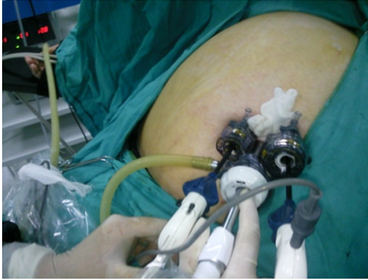
Figure 1. Position of trochars in SILC.