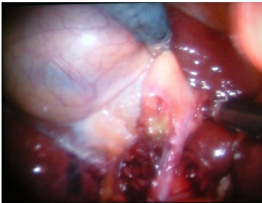
Figure 2. Triangle of Calot.

study and 38 patients excluded. While SILS cholecystectomy was applied to 15 selected patients, 80 patients were randomised. The patients selected for SILS were those with no history of cholecystitis.