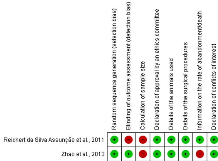
Figure 1. Risk of bias analysis of the articles included in the systematic review.

of periodontal ligament and cement, organization of ligament fibres, and replacement, superficial and inflammatory resorption). The data were extracted by two reviewers independently. In case of disagreement they analysed the article jointly until agreement was reached.