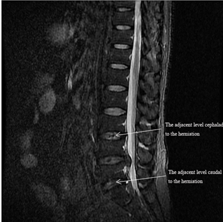
Figure 2. A patient's T2 weighted magnetic resonance imaging, paramedial sagittal image showing adjacent level degeneration. Index level with herniated disc is L4/L5. Cephalad level graded as Pfirrmann 3. Caudal level graded as Pfirrmann 4.

level disc degeneration was assessed on T2-weighted sagittal sequences according to the original Pfirrmann grading scale. The adjacent levels cephalad and caudal to the herniation were graded in the cases of L3/4 and L4/5 levels ( Figure 2 ), whereas only the cephalad disc was graded in the L5/S1 level. The size of annular defect after discectomy was checked by comparing it with a number-1 Penfield probe (6 mm) in the process of TELD. We defined annular defect >6 mm as a large annular defect. Preoperative radiating pain was assessed according to VAS. Postoperative exercises level was classified according to whether patients would exercise paraspinal muscles for at least half an hour every day after TELD.