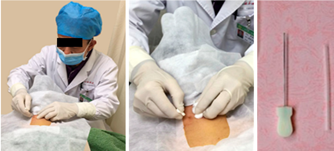
Figure 1. Photographs illustrating microneedle interventional therapy. The left and middle panels show insertion of an acupotomy needle during therapy. The right panel shows a no. 4 disposable acupotomy needle (Hanzhang Type I) with an overall length of 100 mm. The needle body is cylindrical (0.6 mm diameter, 80 mm length) and wedge-shaped with a flat, bladed end that has a flush cut edge (0.6 mm). The handle (20 mm length) has a flat calabash-like shape.

tion, as this was thought likely to improve adherence to treatment. After manipulation, the relevant muscles were massaged, and the patients were asked to perform functional activities before the session was considered finished. If malposition of a segment was successfully corrected, further manipulation of this segment was not performed.