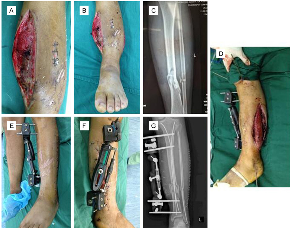
Figure 3. A Gustilo II, 42B fracture occurred osteofascial compartment syndrome with early incision decompression (A-C). The picture presented the fracture was treated with BioEF-TENs system (D). The photos showed that the wound was closed at early stage after dismantling the VSD device (E, F). The postoperative X-ray image of this case (G).

ths intervals, including clinical and radiographic examinations [27]. During the visit, observation of the wound and pin track condition and making sure of the function of the knee and ankle joint were monitored. With callus formed gradually, we loosened compressive blot and removed its rod, and finally removed the external fixator step by step in order to generate dynamisation at fracture site in vitro.