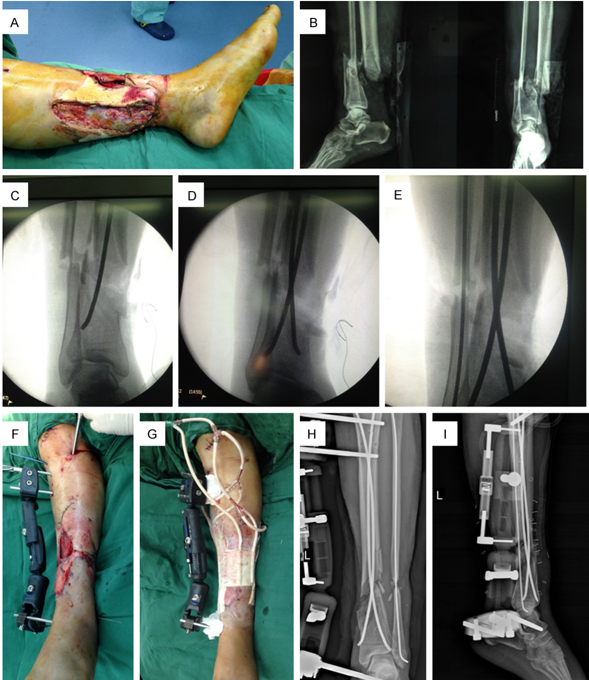
Figure 1. A 50-year-old female with Gustilo IIIB and 43C fracture of the left tibia and fibula, and also sustained an injury of the left femur (A). The X-ray presented a distal tibia and fibula fracture which is not fit for interlocking intramedullary nail because of lock or barrier screws with no enough working length (B). The tibia and fibula fracture was managed by titanium elastic nails and external fixation in sequence (C-F). The photos showed that the vacuum sealing drainage was performed after the fracture was treated with intra- and extramedullary fixation (G). The post-operative X-ray images of this case (H, I).

patient with traumatic splenic rupture and three cases with blunt abdomen trauma. The traumatic splenic rupture case was treated with splenectomy, and the other organ injuries were managed conservatively.