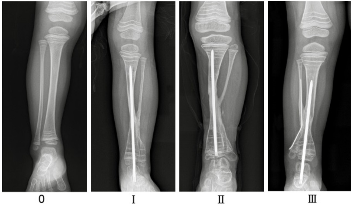
Figure 1. Malhotra ankle valgus grading method.

presents that no ankle valgus occurs and the distal tibia epiphyseal line is horizontal to the malleolar crest of ankle; Grade I presents that the distal fibular epiphyseal line is located at the malleolar crest and is horizontal to the distal tibia epiphyseal line; Grade II presents that the fibular epiphyseal line is roughly parallel to the distal tibia epiphyseal line; Grade III presents that the fibular epiphyseal line is parallel to the distal tibia epiphyseal line. Malhotra I, II, III detected in patients indicated that ankle valgus occurred. The cortical discontinuity appearing on two sides of the pseudarthrosis shown in lateral X-ray film was considered as refracture. The healing was judged by two associate chief physicians using blind method. If the diagnosis results were inconsistent, the judgement was made by another chief physician.