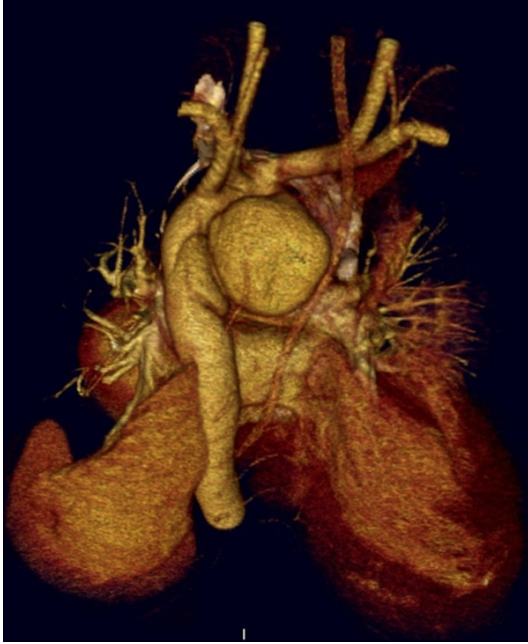
Figure 1. Three-dimensional 16-slice computed tomographic scan demonstrating a false aneurysm at the isthmus of the proximal aorta with the medial aspect of the lumen.

years, and 15 patients underwent single graft surgery. Some cases in these patients with a big pseudoaneurysm on the descending aorta were seen in digital subtraction angiography (DSA). A stent-graft (Lifetech Scientific (Shenzhen) Co., LTD; Guangdong, China or COOK MEDICAL INC. Bloomington, Indiana, USA) was placed inside the descending aorta to isolate the pseudoaneurysm with via femoral artery puncture. Postoperative digital subtraction angiography showed the stent-grafts were placed well, had normal morphology for the proximal aortic. But on the pseudoaneurysm bodies, the stent-grafts were over-spread into the aneurysm cavity and protruded a sharp angle (arrows in Figures 2-5 ) in the aneurysm cavity for during checking of DSA on the operation and for the subsequent checking of computed tomographic angiography about one week. The sharp angle would direct stab in the esophagus through the aorta. This phenomenon occurred in some others report also [38], Chiba D and his colleagues suggested mechanical damage caused by arterial pulsation, stent graft rigidity and interruption of the circulation of the esophageal wall by enlarged aneurysms are all expected to play roles in the development of AEFs also.