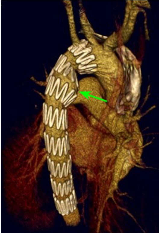
Figure 5. Three-dimensional 16-slice computed tomographic demonstrating the stent graft (COOK MEDICAL INC. Bloomington, Indiana, USA) over-spread into the aneurysm sac at the pseudoaneurysm with a sharp angle (arrow).

examination. Endoscopy is the most sensitive and specific diagnostic test [56], it can provide a clear view onto the stent-graft in esophagus [23, 51, 63]. The supine chest x-ray has been the basic screening tool for AEF. High resolution CT provides clear view of blood vessels and can provide accurate diagnosis, and it also helps to assess a suspected aortic pseudoaneurysm, mediastinitis and the extent of soft tissue involvement. It is also helpful in planning for therapeutic drainage or aspiration [57]. CT scans rarely detect fistulous tracts, and suggestive signs are present in most patients, including air bubbles into the thrombus, peri-aortic fluid collection, oesophageal or bronchial wall thickening and lung consolidation [58].