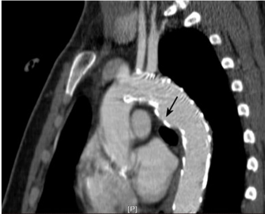
Figure 3. Sagittal plane of a 16-slice computed tomographic demonstrating the stent graft (Lifetech Scientific (Shenzhen) Co., LTD; Guangdong, China) over-spread into the aneurysm sac at the pseudoaneurysm (arrow).

most common cause of AEF after TEVAR at a similar view [13, 41]. 2) Yamanaka K and his colleagues described an AEF caused by a piece of polytetrafluoroethylene (PTFE) thread after total aortic arch grafting in thoracotomy, this PTFE thread as a sharps direct stab in the esophagus [51]. 3) Li HP and his colleagues described an AEF, which was reasonable to suspect the aortic wall was gradually eroded by the vascular clip using in esophagectomy. They suggested it is possible that the vascular clip was applied in an angle against aorta, which induced aortic wall injury [52]. 4) Sansur CA and his colleagues described an esophageal fistula, which they suggested the perforation of the esophagus occur as a result of protruding screws from a cervical plate or fixation of the anterior cervical spine, these protruding screws as a sharps direct stab in the esophagus [56]. 5) Okita R and his colleagues described an esophageal fistula, which reported a 65-year-old man with complications of AEF after esophagectomy with a surgical stapler [54]. Chen YY and his colleagues described an esophageal fistula, which due to using a transoral circular stapler after thoracoscopic esophagogastrotomy [55]. These reports had a common characteristic: the staple line of the gastric tube at lesser curvature was not oversewn, the staple line of the gastric tube led to direct contact adjacent organs with the exposed metallic staples as a sharps [54, 55].