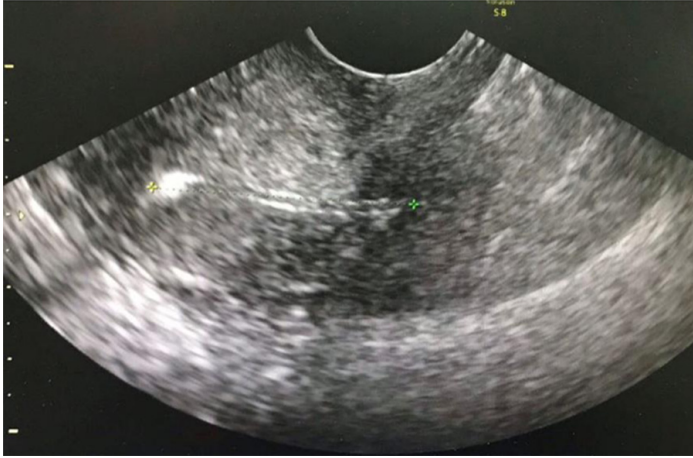
Figure 1. Transvaginal ultrasound showed a linear hyperechoic foreign body in the pelvis, with one end of it having perforated through the posterior wall of the uterus, and the other end having perforated the left fallopian tube with a possible adhesion formation.